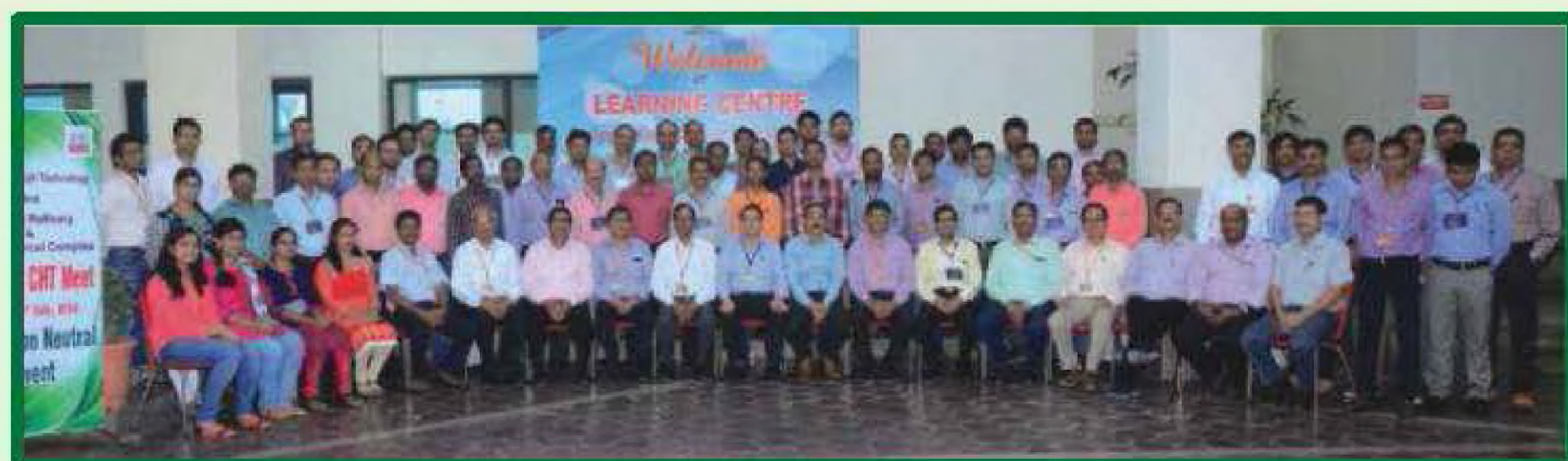
Participants of the 44 th ACM on Fluidized Catalytic Cracking at IOCL Panipat Refinery

18 th Activity Committee Meeting on Distillation was organized at IOCL Mathura Refinery during 11 th -12 th August, 2016 which was attended by 65 participants from Indian PSU, Private and JV refineries apart from