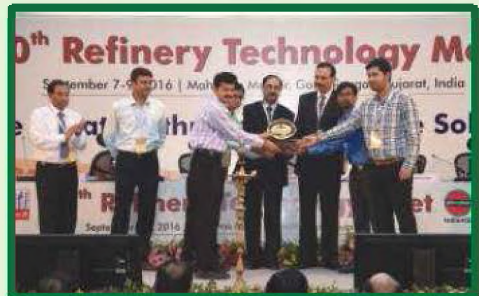
Team IOCL receiving the first prize in the category 'Best Innovation in Refineries - Team'