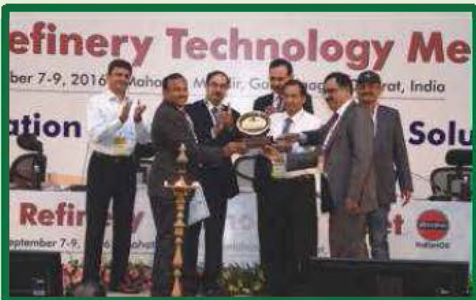
Team IOCL (R&D) receiving the first prize in the category 'Best Indigenous Technology - Team'