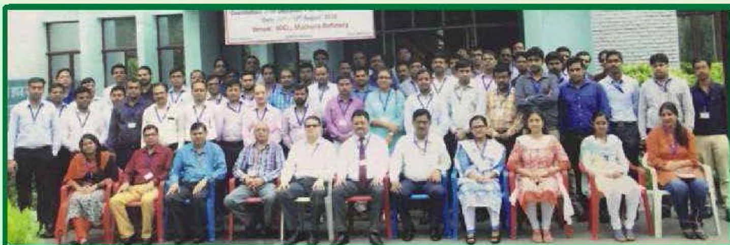
Participants of the 19 th ACM on Distillation at IOCL Mathura Refinery