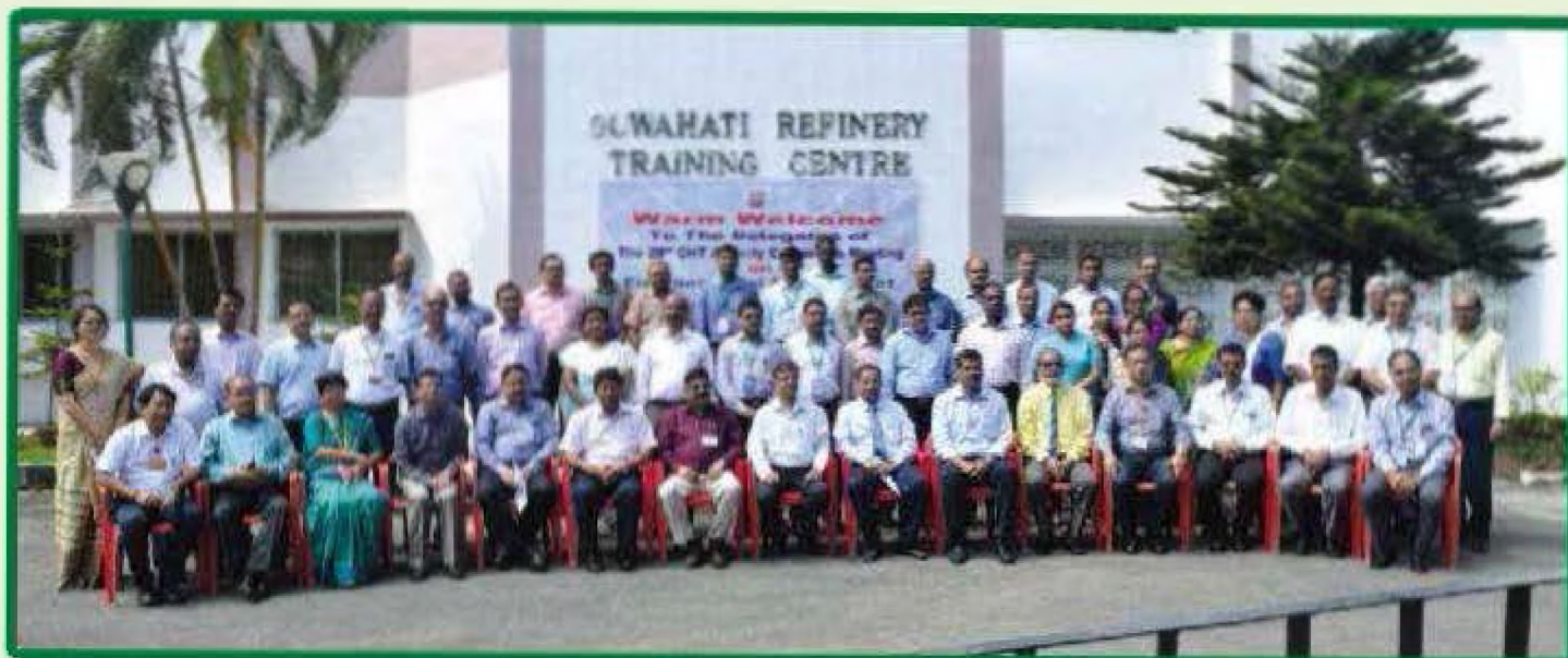
Participants of the 29 th ACM on Environmental Management at IOCL Guwahati Refinery