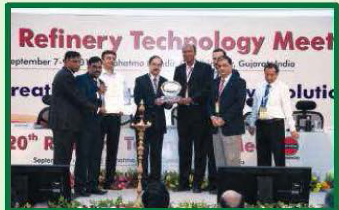
Team HPCL-R&D receiving the prize in the category 'Best Innovation in R&D'