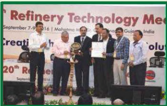
Team CSIR-IIP receiving the prize in the category 'Best Innovation in R&D'